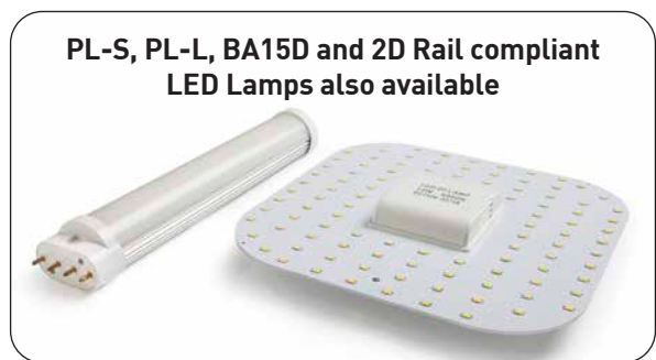
PL-S, PL-L, BA15D and 2D Rail compliant LED Lamps also available