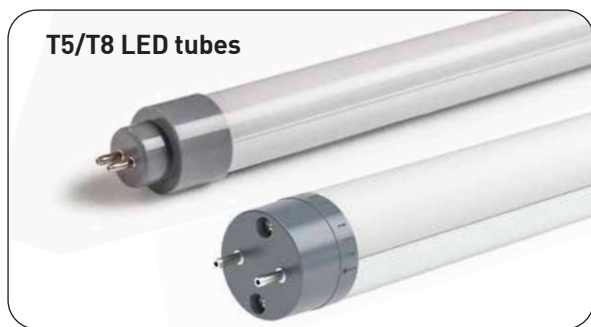
T5/T8 LED tubes