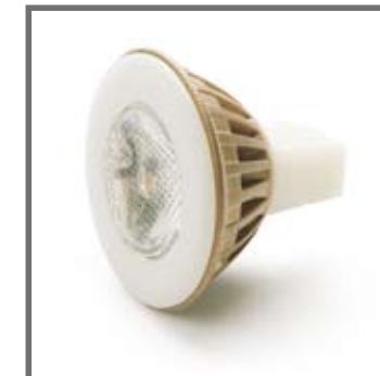
MR16 SINGLE LED