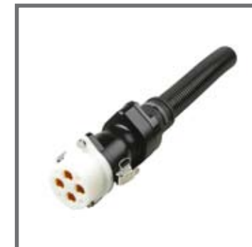
MODULE 32 JUMPER PLUG