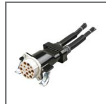
MODULE 42 DOUBLE CONDUIT