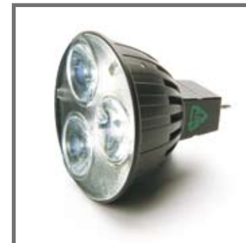
MR16 TRIPLE LED